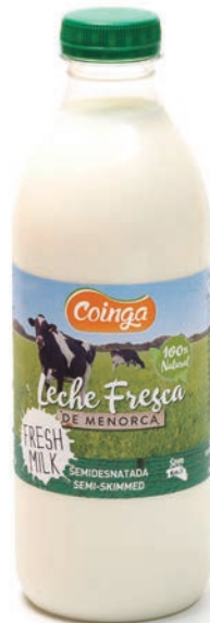
Fresh Skimmed Bottle PET 1 l

Daily we collect milk from our farmers to package it as fresh as possible. A short and controlled route to respect the unique taste of milk produced in Menorca , declared a Biosphere Reserve by UNESCO.