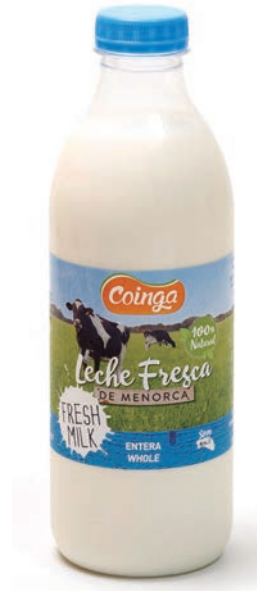
Fresh Whole Bottle PET 1l

From the pastureland to your home, naturally.